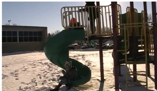
PBIS Detectives Madison Elementary