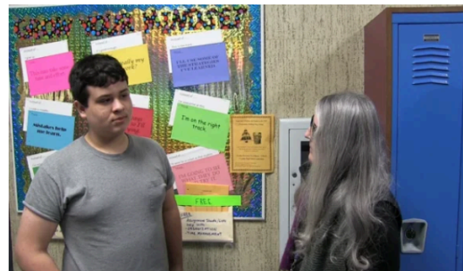
FHS PBIS Positivity Challenge