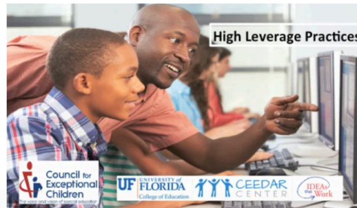
High Leverage Practice #8: Effective Feedback