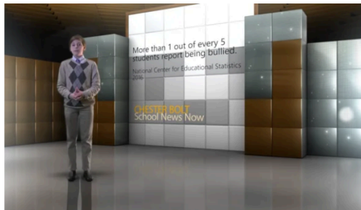
Peru Elementary School's 2018 ISAB Video