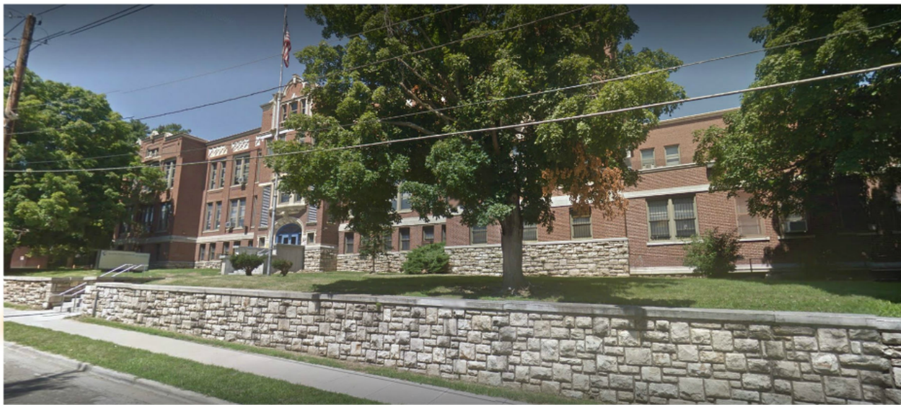
James Elementary School Kansas City Public School District