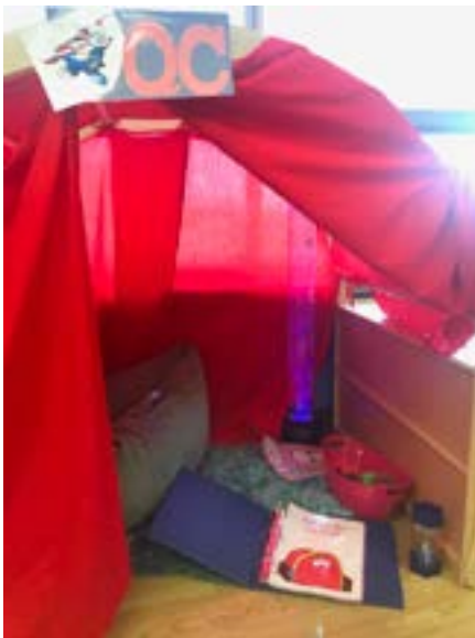
From our social skills story: I love my friends and I love when they spend time with me, even if they need my help. I'm strong and quiet, very comfy and can help solve lots of problems. I'm QC, the classroom sensory quiet corner.

ODRs - 17 97% - 0-1 ODRs 2% - 2-5 ODRs 1% - 6+ ODRs