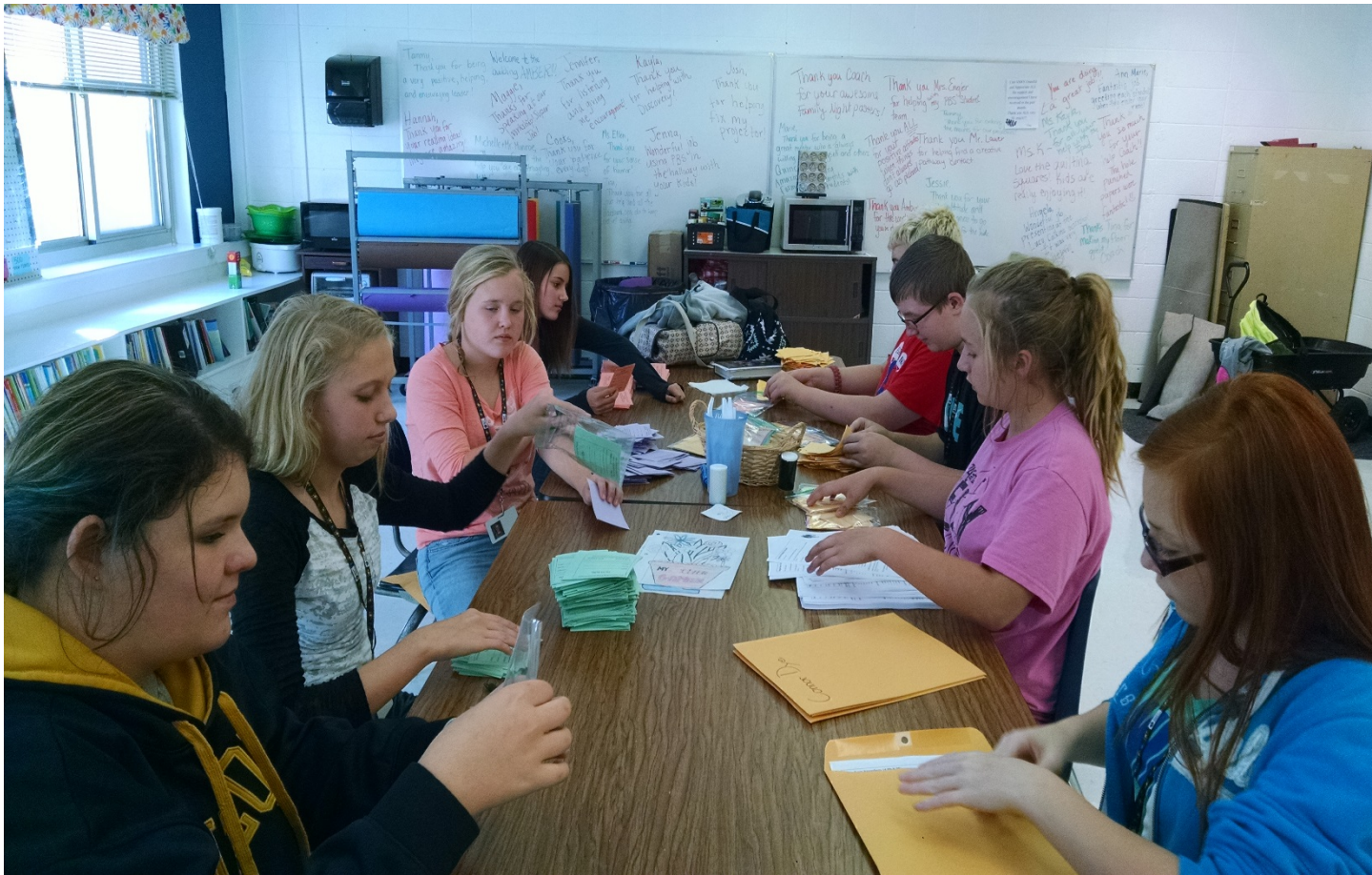
Daily Leadership class