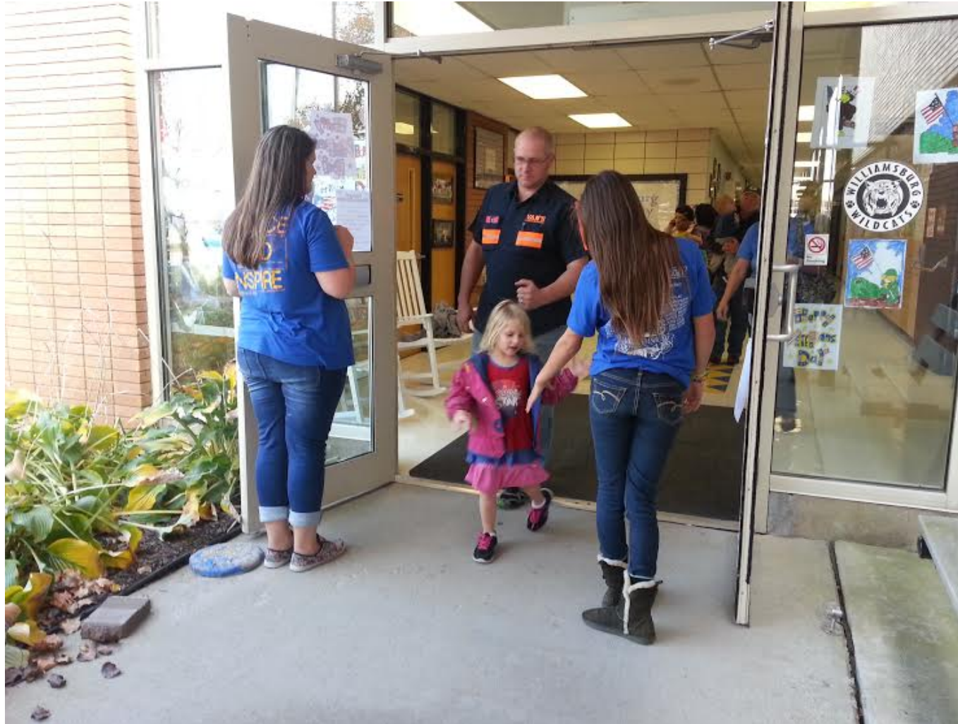
Door greeters for school events